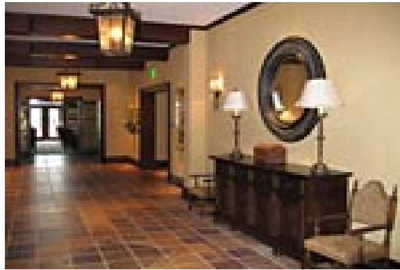
Duroplex® Tuscany DS II

Duroplex® in a TUSCANY DSII finish is the dominant wall finish throughout the two floors of the facility; however two ballrooms on the second floor feature Spatula Stuhhi™ OPACO in a chocolate colored effect. The TPC is located in the same development complex as is the Marriott Sawgrass (Antigua DS II), which was featured in a previous Notable Projects Report.